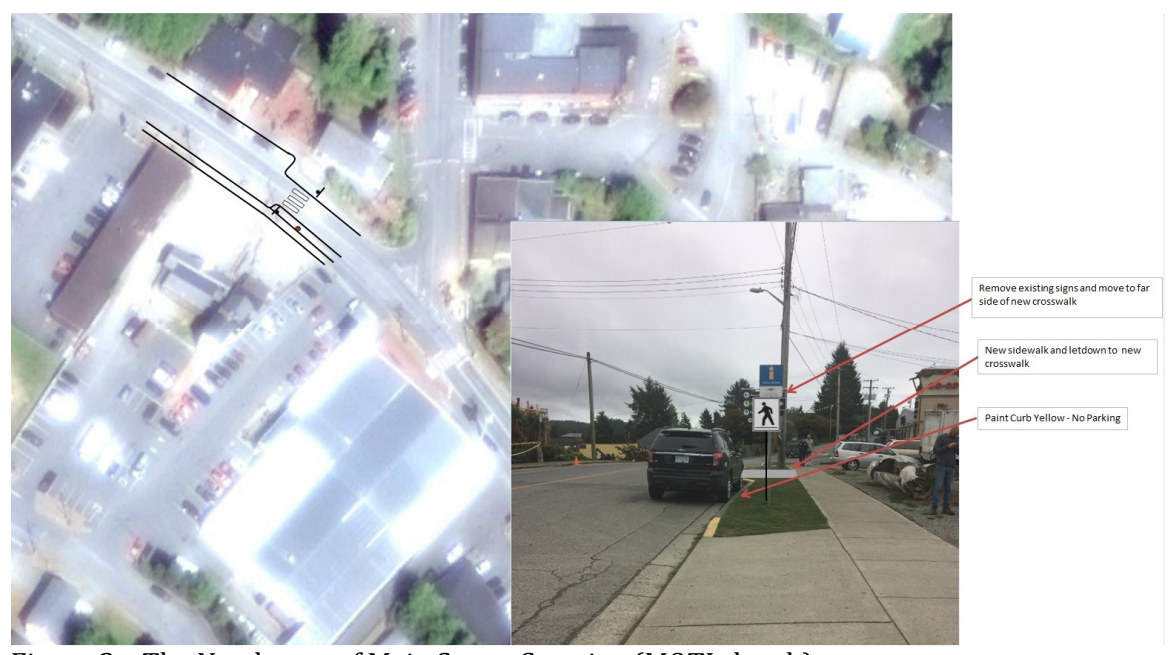
Figure 2 – The Northwest of Main Street Crossing (MOTI sketch)

The first proposed crossing is on the northwest corner of the Peninsula Road and Main Street intersection ( Figure 2 ). This corner has many challenges and this crossing is not meant to fix all the challenges but to make the pedestrian crossings that are happening there anyway, happen in a safer manner. The curbing at this location is already bumped out towards the road centerline and the work required is curb let downs, a concrete pad on each side, line painting and signage.