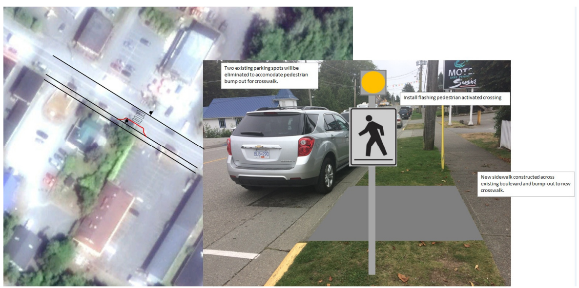
Figure 3 – Mid-Block Crossing (MOTI sketch)

The second location is mid-block on Peninsula Road between Bay Street and Main Street ( Figure 3 ). This location is more complex. Peninsula Road in this location is two vehicle lanes widths and 2 parallel parking widths with only the southwest (" SW ") side having a sidewalk. For a crossing to be safely located, with the proper pedestrian sightlines, a bump out or safe area will need to be considered for both sides of Peninsula Road.