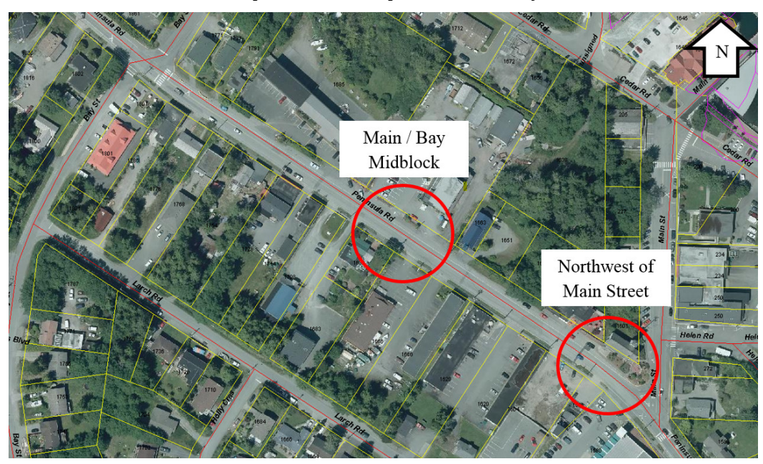
Figure 1 – Crossing locations

Working MOTI and ICBC Planning Staff identified the two crosswalk locations ( Figure 1 ) that all parties considered are the most important from a pedestrian safety context.