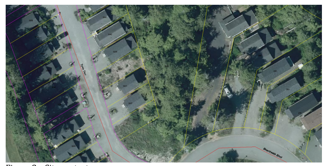
Figure 2 – Site context